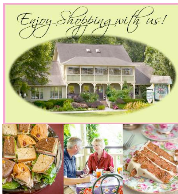
A Day in the Country with Café on the Veranda

Allow time for shopping after lunch in the 10,000 square gift and boutique shop!