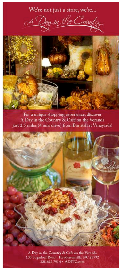
A Day in the Country

Mid-Morning - Depart for home with stories and memories of the unique and fun experiences from your trip to the beautiful mountains of Western North Carolina.