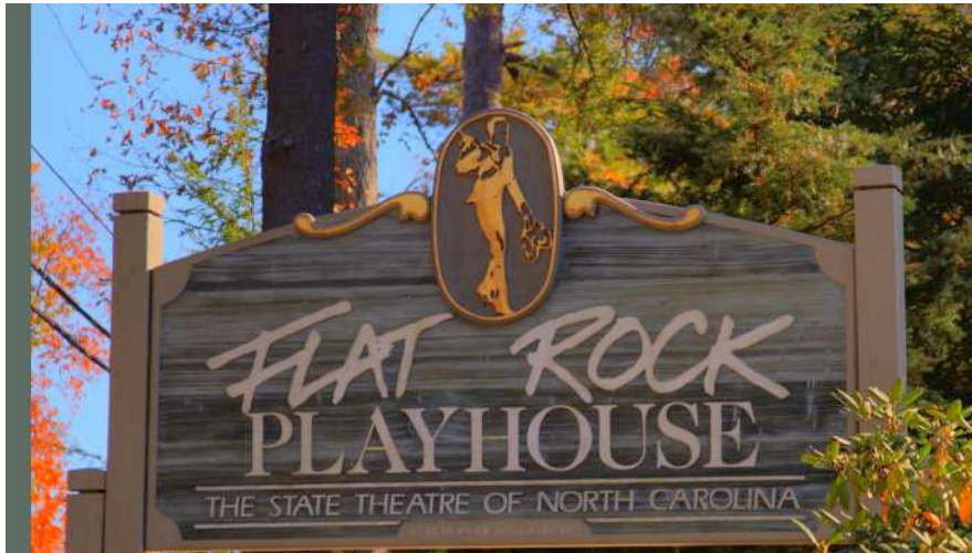
Flat Rock Playhouse Mainstage Entrance