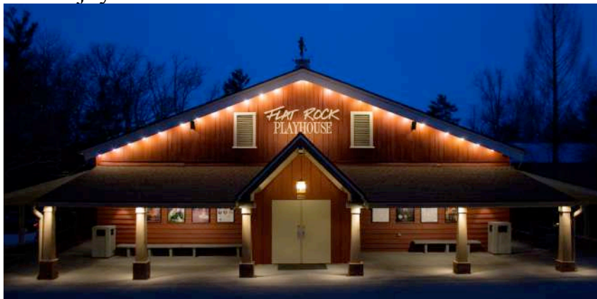
Flat Rock Playhouse Mainstage

Arrive at Flat Rock Playhouse ( www.flatrockplayhouse.org ) for an evening of Broadway style entertainment with a show selected especially for your group. Flat Rock Playhouse has been entertaining guests for years. This professional equity theater provides quality entertainment for audiences young and old alike with comedies, musicals and dramas. Sit back, relax and enjoy the show!