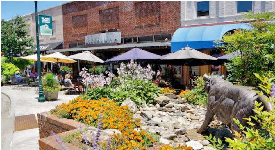
Downtown Hendersonville, NC

11:00 am After shopping, enjoy lunch on your own in Downtown Hendersonville at one of many wonderful sidewalk cafes and restaurants.